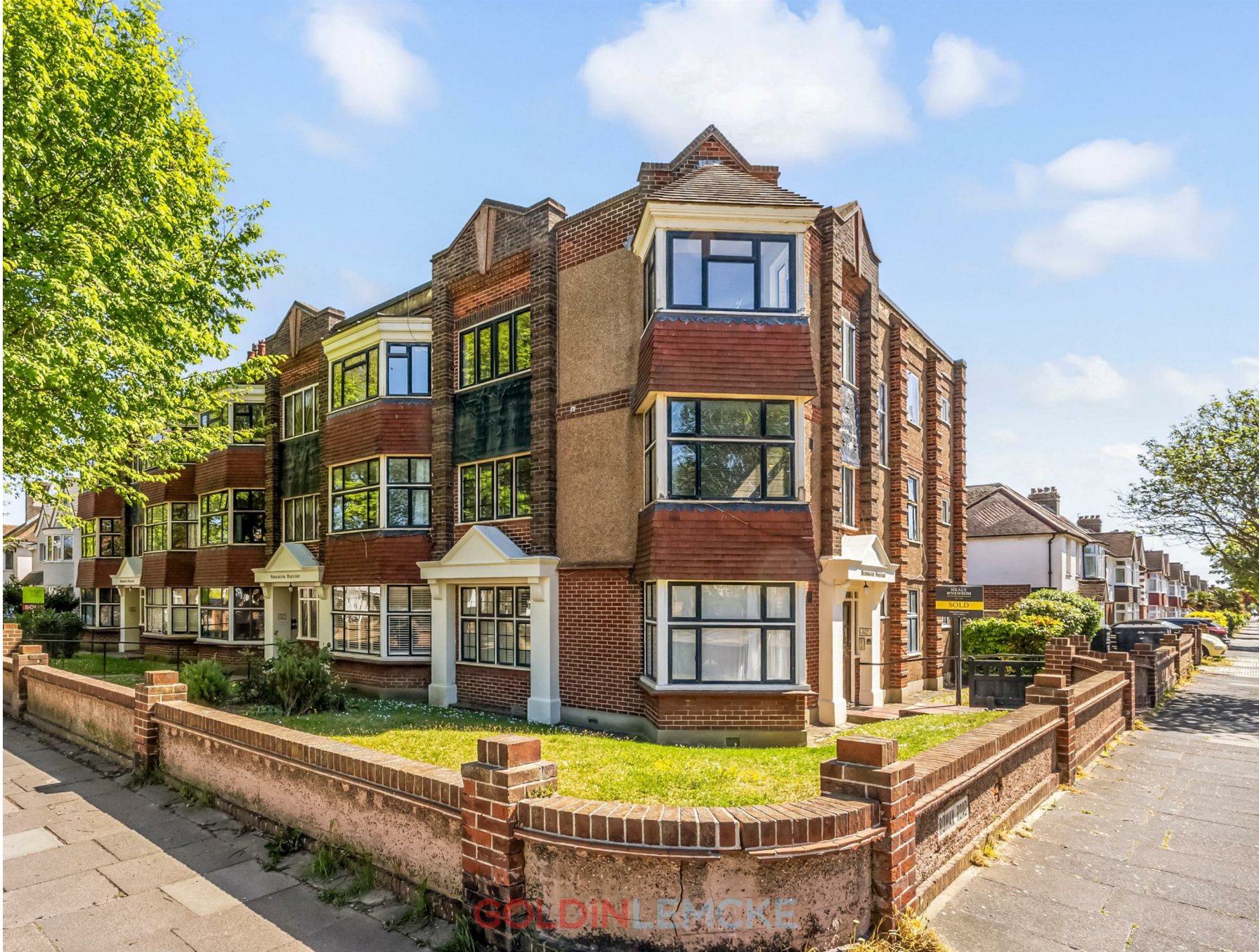
Mornington Mansions, New Church Road, Hove, BN3 £325,000